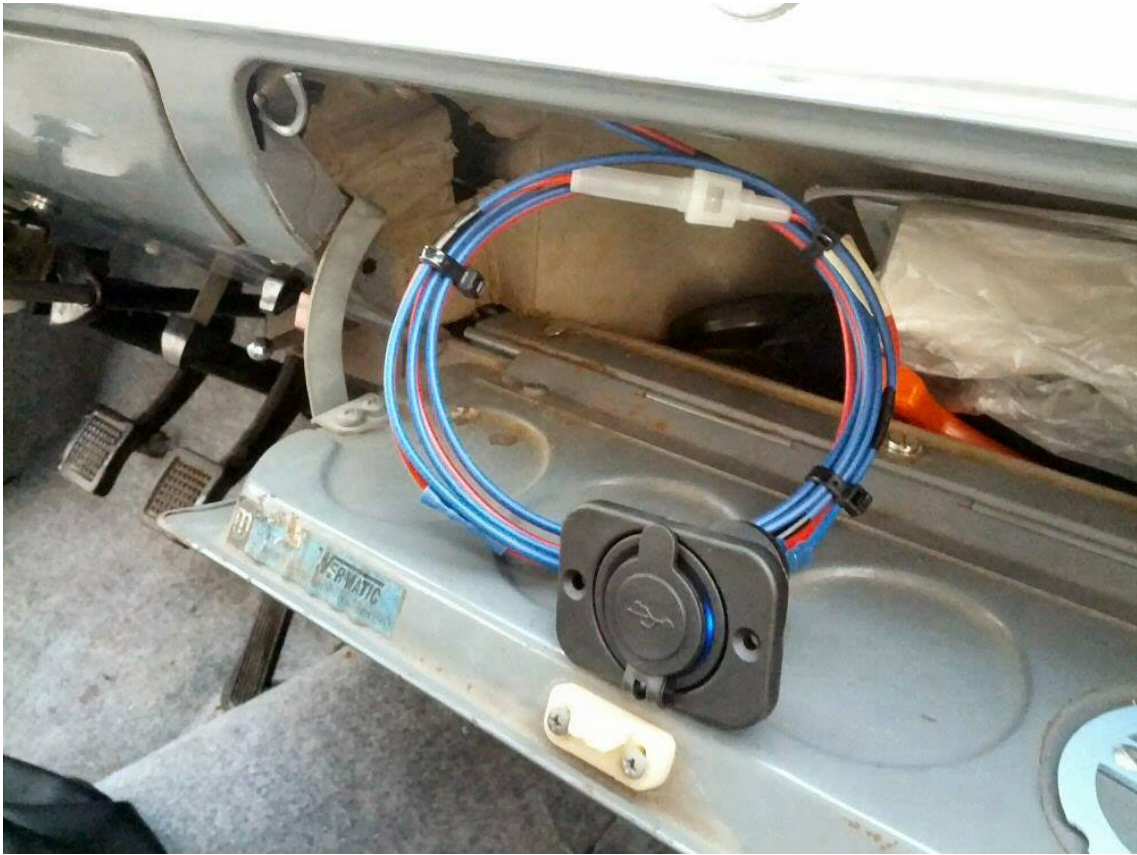
The first mod - an USB charging port.