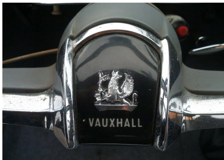
Vauxhall badge on the steering wheel.

Julia, as the car is named, is now awaiting an alternator install, carburettor and fuel pump rebuild and some general service before she's back on the road again.