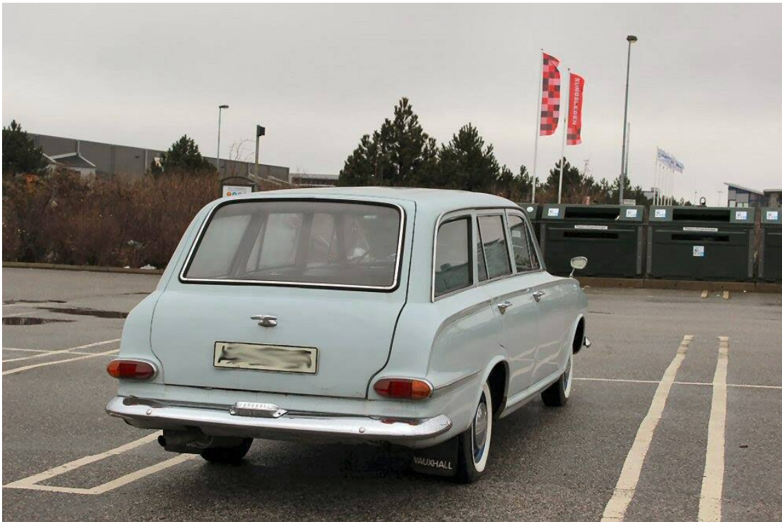
At the mall taking some photos.