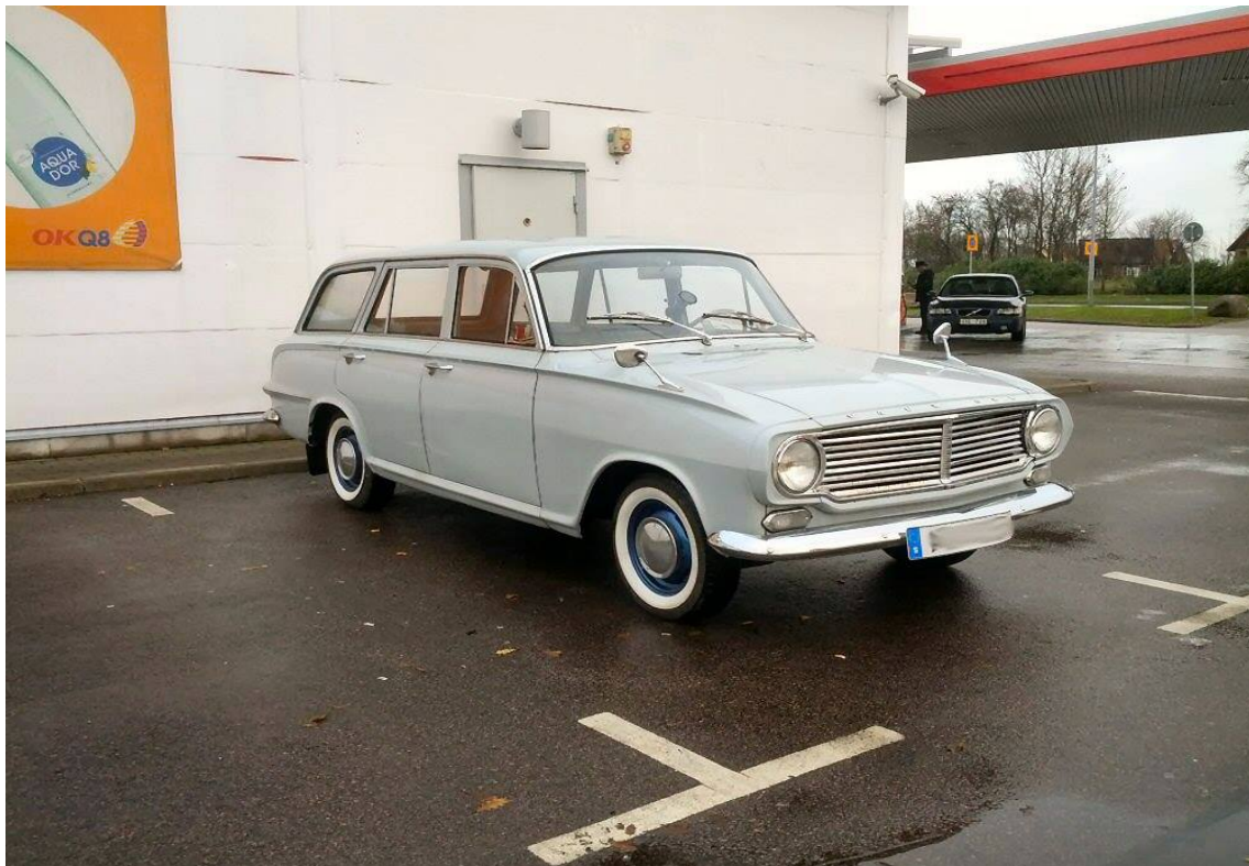
Relaxing at the petrol station just after the purchase.

In the internet ad the car had appeared drivable and in ok condition. The seller first needed to change the battery, and then fiddle with the carburettor to get the engine to fire and stay running. Then it was time for my test drive, and it went fine. Only some minor remarks, like the left blinker didn't work (which I fixed later). We negotiated an exchange of my modern comfortable Saab for the Vauxhall.